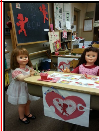
Visit the Museum !

A committee worked on "How We Entered, and When We Came," a book of documents on early integration in Park Forest. The book became part of the Park Forest Public Library archival collection, now maintained by the Park Forest Historical Society at 227 Monee Road. A copy is in the library and the original is in the Park Forest History Files with the Society.