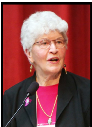
PFHS Board Nomination

Because of dwindling attendance, the Club disbanded in 2012, but not before endowing a $50,000 nursing scholarship program through Prairie State College., leaving a lasting legacy of service to the community.