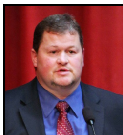
Nominated by Village Manager